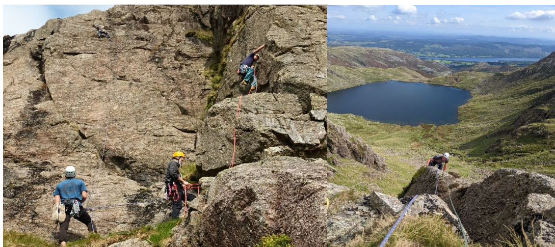
Oreads climbing on Low How.