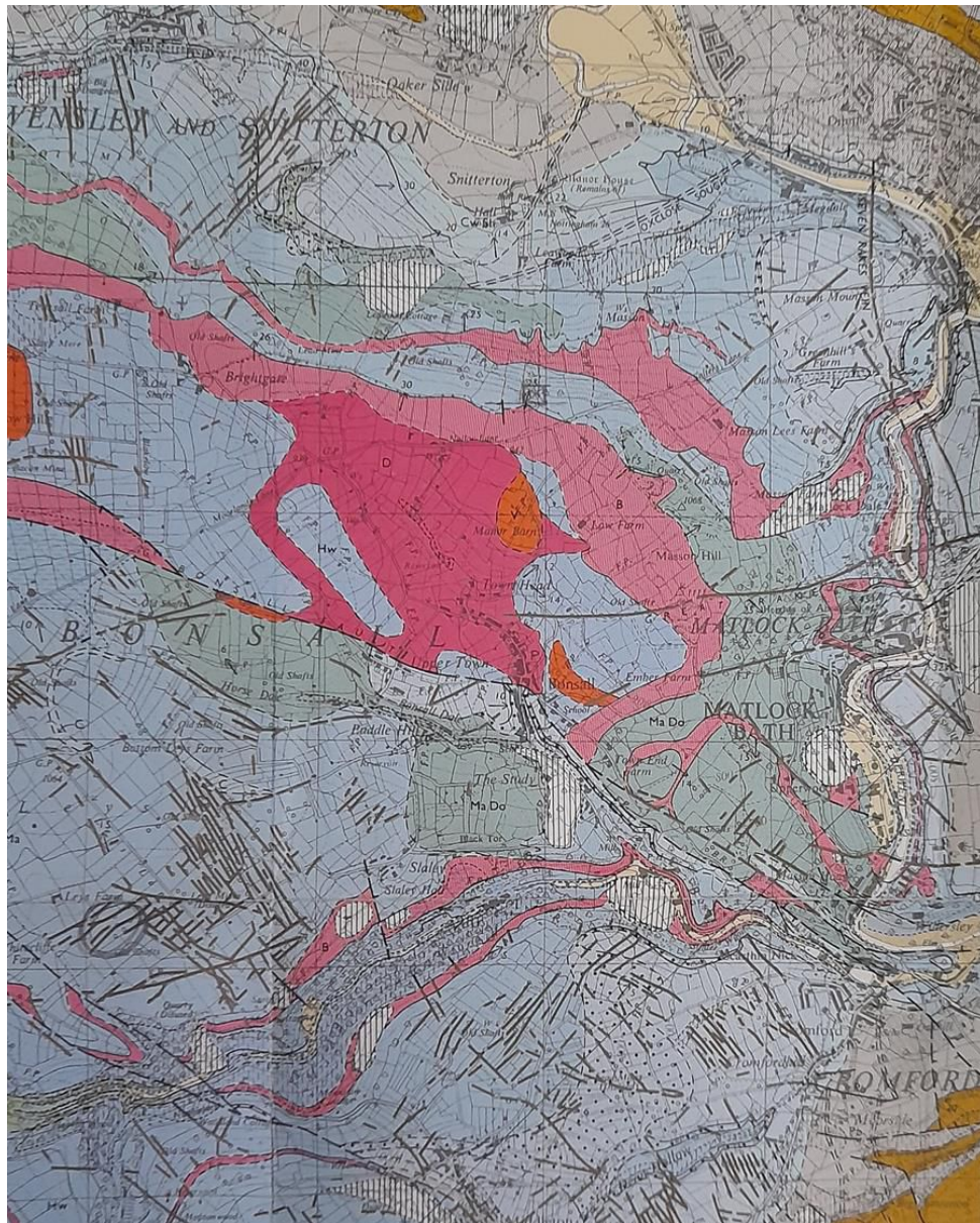
Extract from Geological Special Sheet Matlock 1971 Published by the Ordnance Survey for the Institute of Geological Sciences.

https://peakdistrictgeowalk.org . Focussing on the geology of the area, they should be a great introduction to the rock-climbing opportunities the Peak has to offer. I'm hopeful that seasoned climbers will participate and introduce newer climbers to what is on offer. The OS Geology Map below illustrates the extraordinary geology of the Matlock area alone.